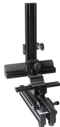
iQ-Align for CAL3