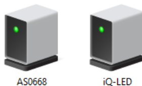
Hardware Manager: active iQ-LED and spectrometer