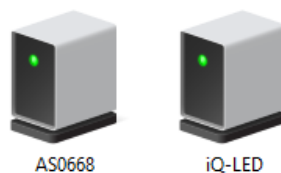
Hardware Manager: active iQ-LED and spectrometer